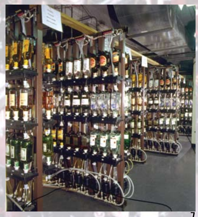
Laser ™ Space Saver mounting racks