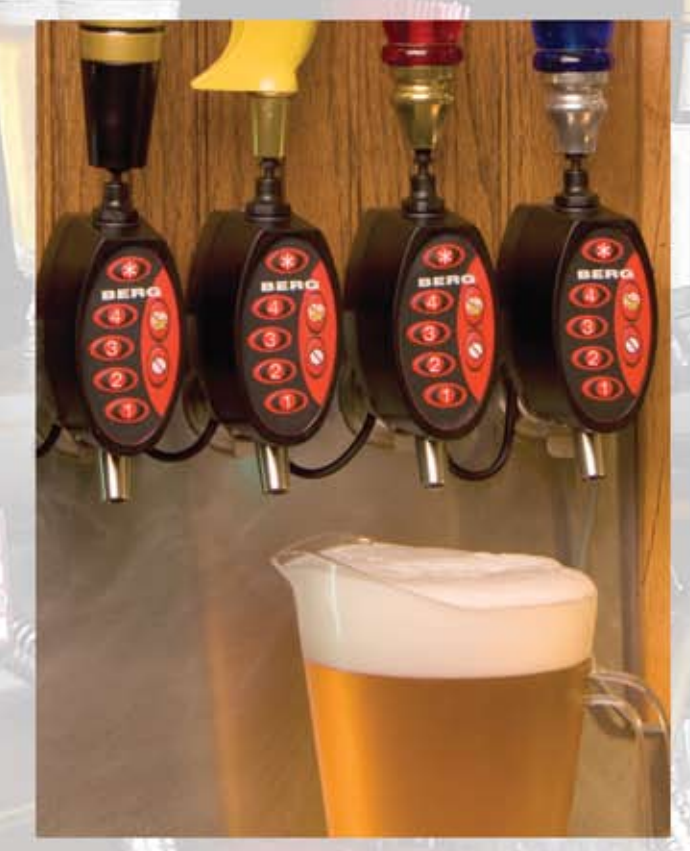
Tap2™ Draft beer bar area installation