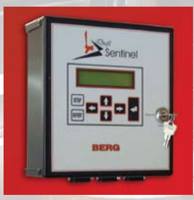
Sentine! Draft beer control console

This product meets and is certified to NSF standards.