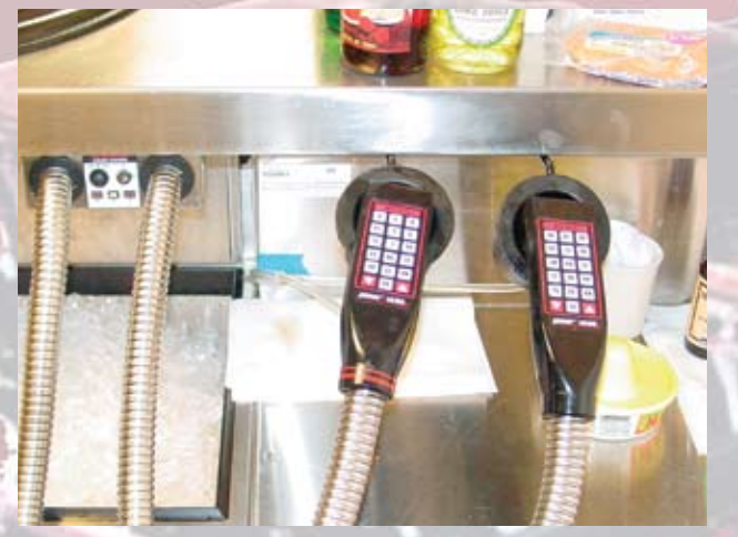
Laser ™ installation