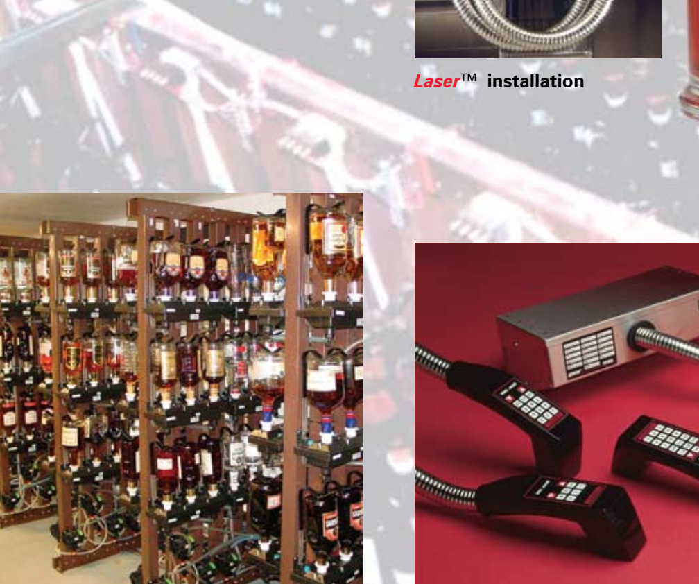
Laser ™ Space Saver mounting racks