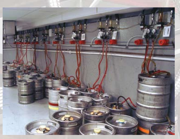
Tap2™ Draft beer supply room installation