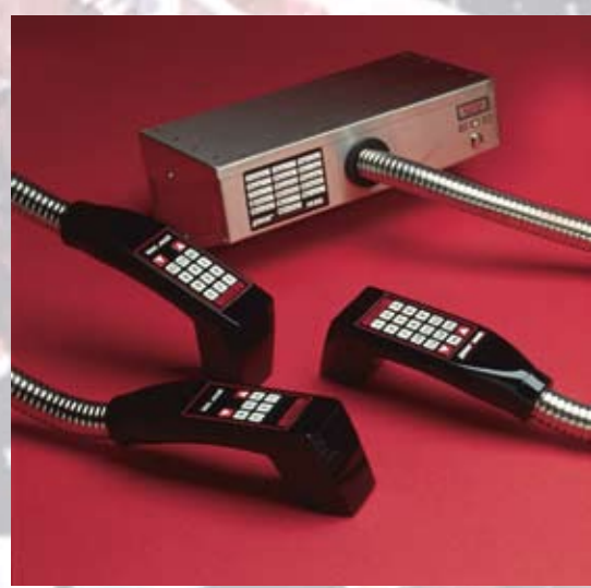
Laser ™ model dispensers