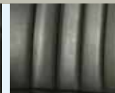
Inside Back Channels Specify CHI.