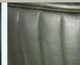
Outside Back Channels Specify SCO.