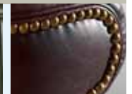
Outside Brass Nail Trim Specify BNO.

▲ Shown with upholstered buttons (UPB). Also available in Brass (BRB) and Chrome (CHB) buttons. Please specify.