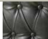
Outside Button Tufted Back Specify BTO.