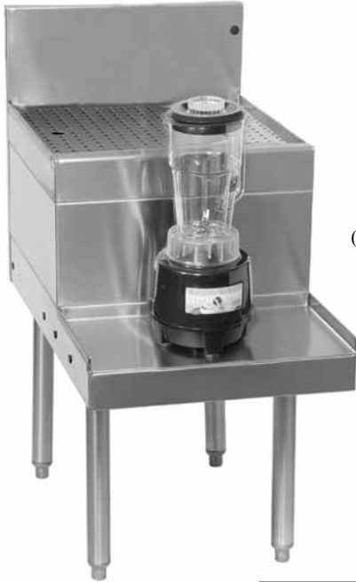
DBSB-18 (Blender not included)

DBSA-12, DBSA-14, DBSA-18, DBSA-24, DBSA-12-RF, DBSA-14-RF, DBSA-18-RF, DBSB-12, DBSB-14, DBSB-18,